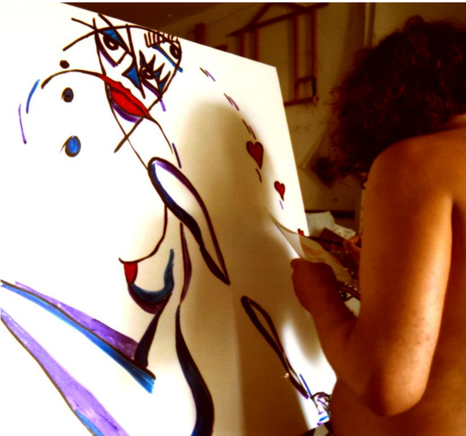
Paris Pelouse de la Temple Girl